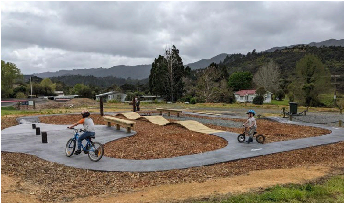
Skills park up at Ride Coromandel