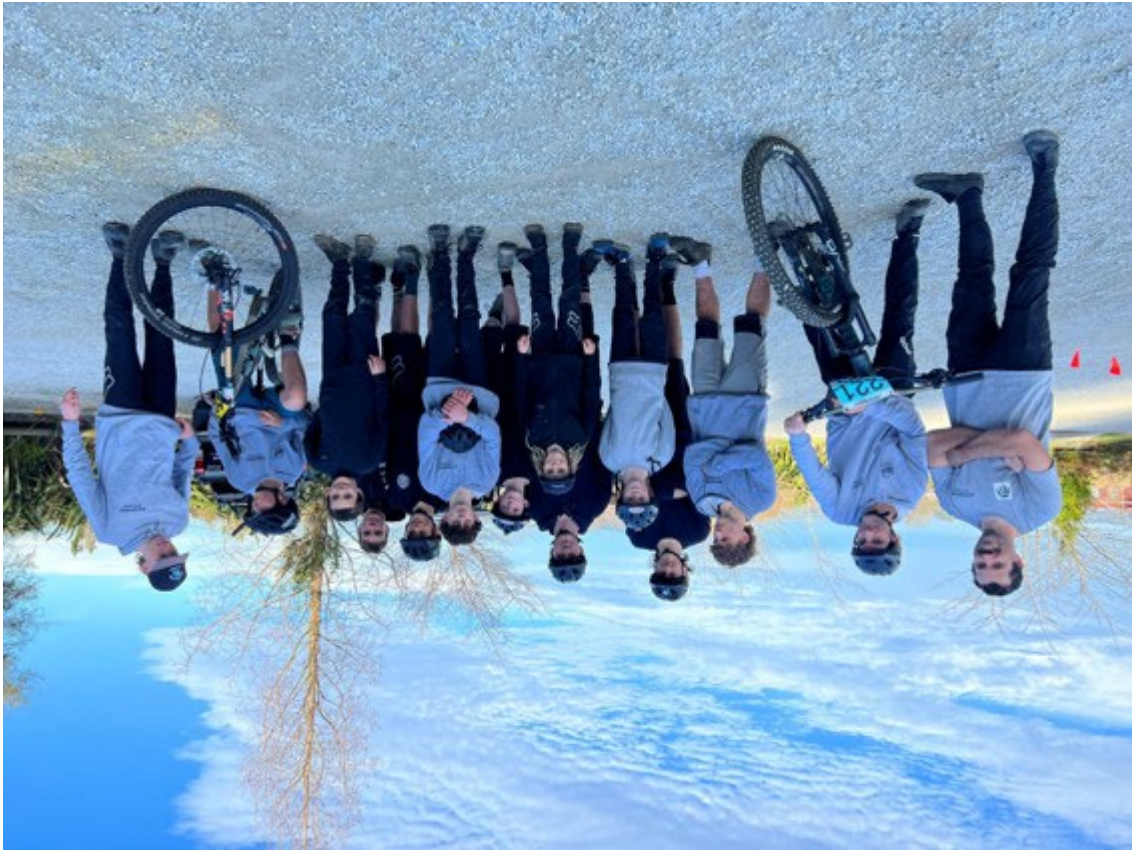
Whangamatā MTB club representing at events