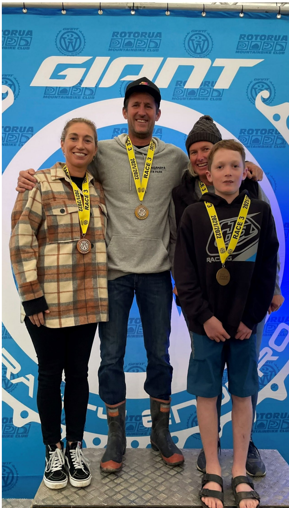
Club members on the podium at the GIANT 2W