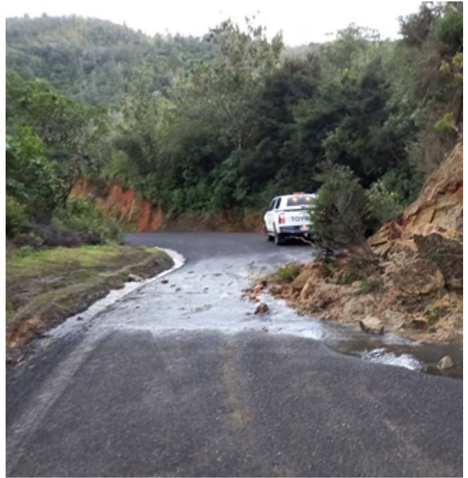
Site 4 – Tapu Coroglen Road