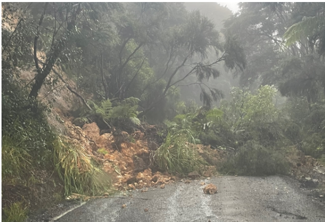
Site 9 – Tuateawa Road