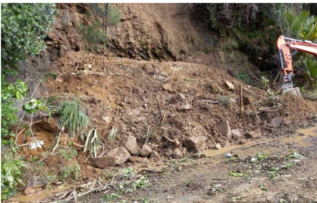
Site 7 - Old Coach Road