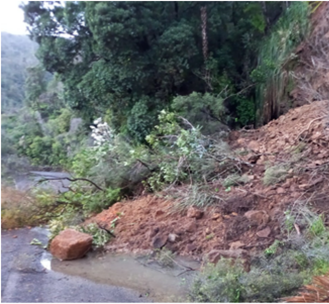
Site 3 – Tapu Coroglen Road