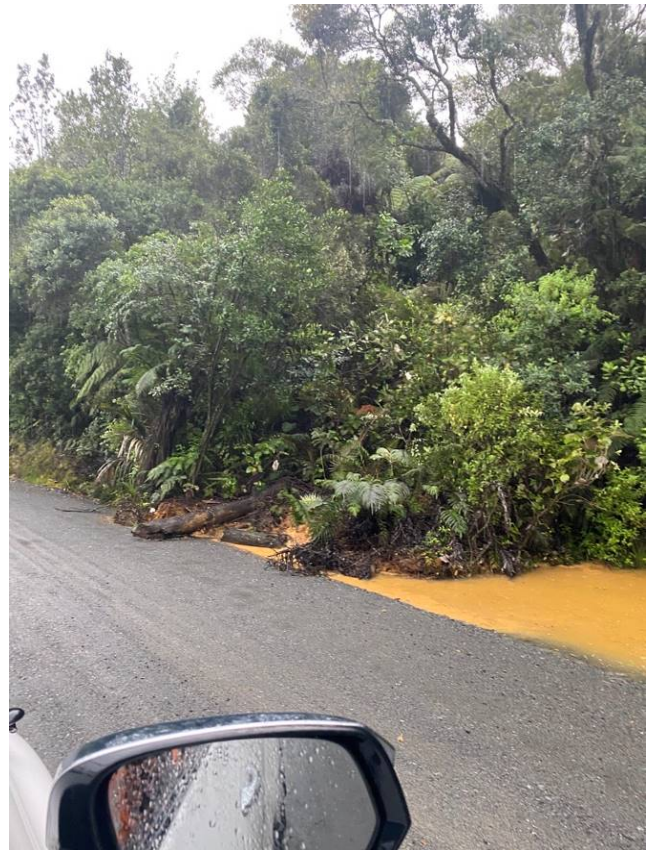
Site 12 - Kennedy Bay Road