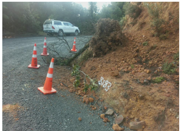
Site 8 – The 309 Road