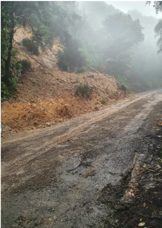
Site 11 – Tuateawa Road