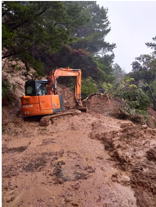
Site 1 - Bluff Road