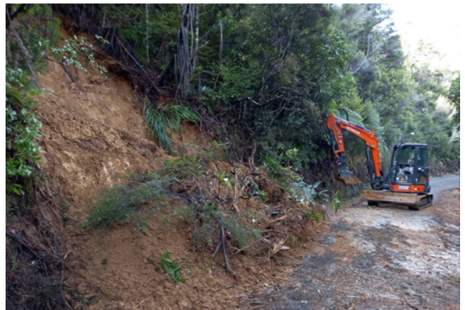
Site 6 – Old Coach Road