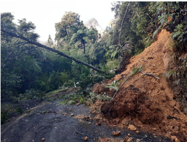
Site 5 – Tapu Coroglen Road