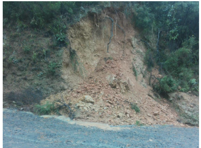
Site 10 - Tuateawa Road