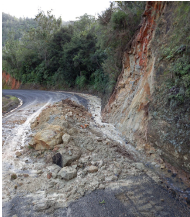
Site 2 - Tapu Coroglen Road