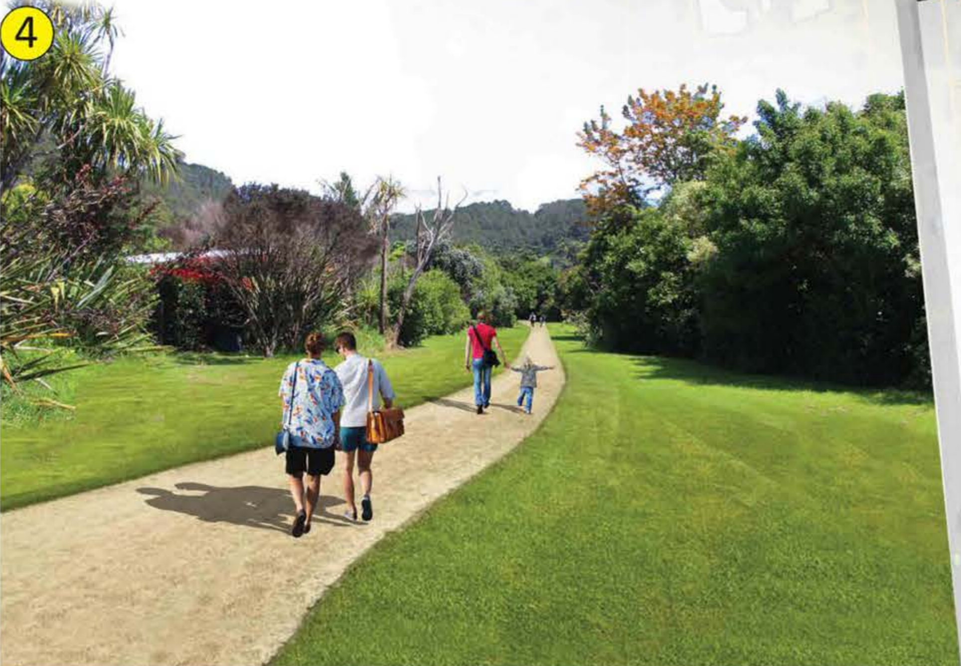
HOGGIN FOOTPATH IN RESERVE In areas with drained soil Hoggin footpaths will be used