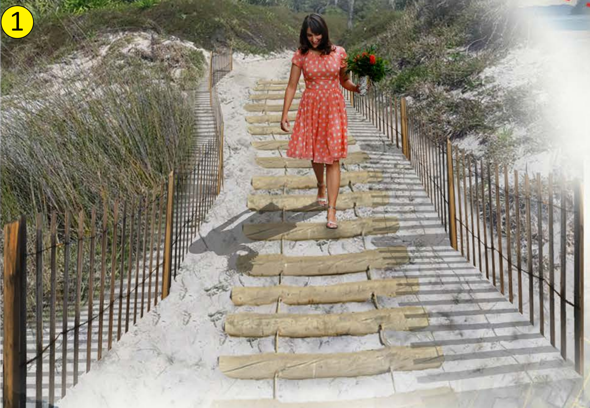
Sand Ladder Protection of sand dunes with Manuka fencing and Sand ladder